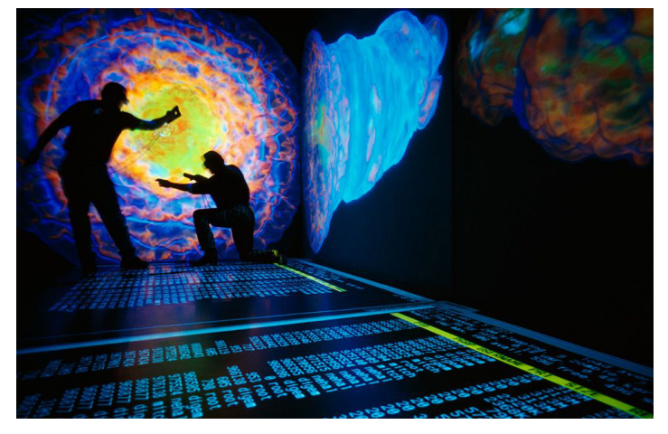
Researchers gain important insights on nuclear explosions using simulations on the National Laboratory System's high-performance computers.

Since leading America's successful effort to develop nuclear weapons in World War II, the U.S. Department of Energy's National Laboratories have played a central role in keeping our nation secure. That role has expanded and evolved so that the National Labs—in addition to ensuring the safety and reliability of the U.S. nuclear deterrent—are also working to prevent the proliferation of weapons of mass destruction, develop advanced technologies for counter-terrorism, and respond to a host of new threats, from bioterrorism to cyber attacks. With worldclass research facilities and a unique capacity to assemble interdisciplinary teams of scientists and engineers, the National Lab System is an indispensable resource in the race to meet this century's complex and rapidly changing security challenges.