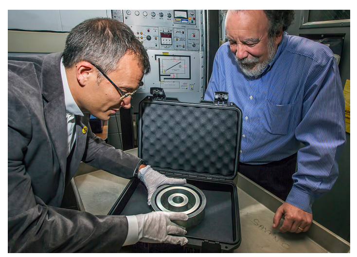
DOE National Laboratory scientists are developing a unique process to verify that nuclear weapons to be dismantled or removed from deployment contain true warheads.

Understanding and mitigating the dangers posed by weapons of mass destruction is another key part of DOE's national security mission. To reduce the risk of terrorists or rogue nations acquiring nuclear weapons, the National Labs are